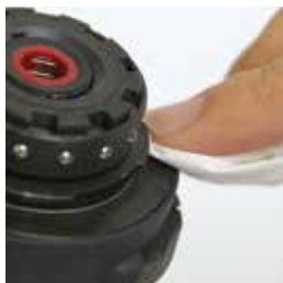
Remove debris from Seal Ring and wrist connection point.