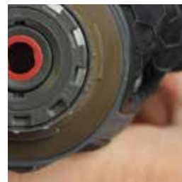
Take care not to scratch the metal surfaces of the hand.