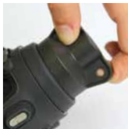
Tighten using the Seal Ring Installation Tool.