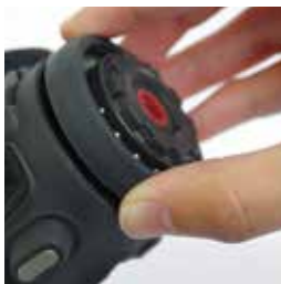
Connect the Seal Ring by slotting it onto the hand and rotating clockwise.