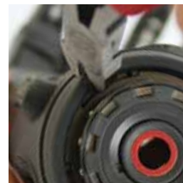
Use side-cutters to cut the plastic inner of Seal Ring.