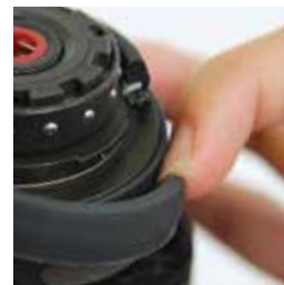
Remove remaining Seal Ring.